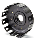
GYTR® Billet Clutch Basket