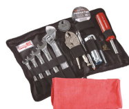
Metric Tool Kit