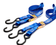
Yamaha Cam Buckles Tie-downs