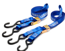
Yamaha Cam Buckles Tie-downs