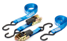
Yamaha Ratcheting Tie-downs

For all YFM90R accessories go to the website, or check your local dealer