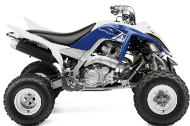
Special Edition Blue