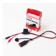
YEC Battery Charger Indicator