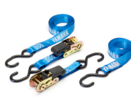
Yamaha Ratcheting Tie-downs