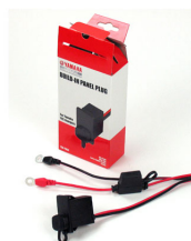
YEC Battery Charger Built-in Panel Plug