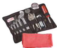
Metric Tool Kit