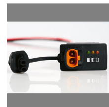
YEC Indicator Panel 150

For all YFM700R SE accessories go to the website, or check your local dealer