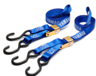
Yamaha Cam Buckles Tie-downs