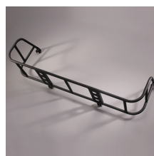
Extension Rack Rear, Wrinkle Finish