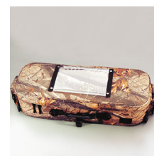
Front Rack Bag Realtree Hardwoods® Camouflage

For all Grizzly 450 EPS accessories go to the website, or check your local dealer