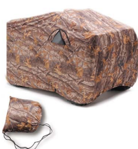
ATV Cover Realtree Hardwoods Camouflage