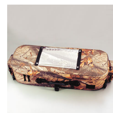
Front Rack Bag Realtree Hardwoods® Camouflage

For all Grizzly 350 4WD accessories go to the website, or check your local dealer