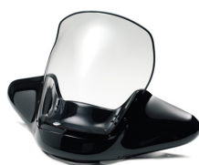
ATV Fairing Black