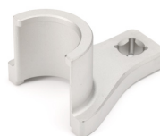
ATV Shock Adjuster Tool