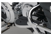
Billet Passenger Floorboards