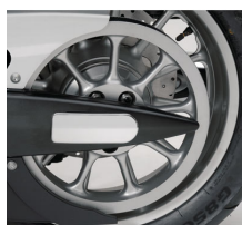
Billet Rear Axle Covers