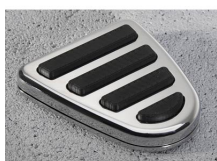
Billet Brake Pedal Cover